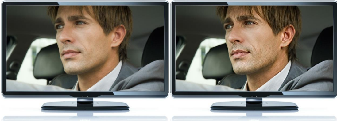
Ordinary High Def